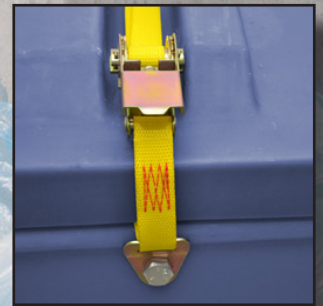
Bolt-On Tension Straps