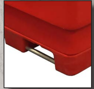
Bolt-On Rotatable Pallet