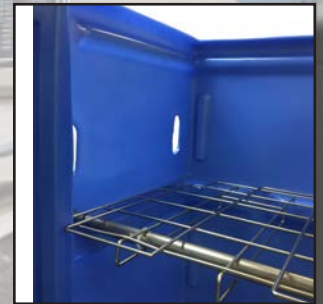
Removable & Non-Removable Shelves