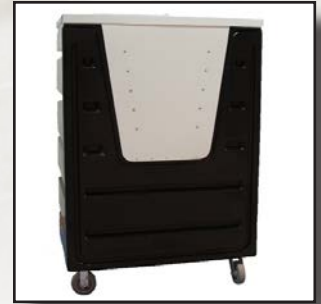
Lid & Door