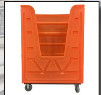
Lower Cut Front