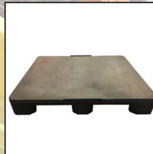
Flat Top Pallet