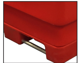
Bolt-On Rotatable Pallet